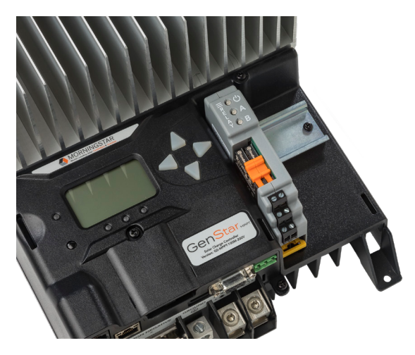
FEATURES: Relay A Operation LED Relay B Operation Block Status LED LED Connecting Pins Relay B (right) Relay Release Relay Terminals Tabs<sup>1</sup> Common A or B Normally open (NO) A or B Relay A (left) Normally closed (NC) A or B Locking Slider