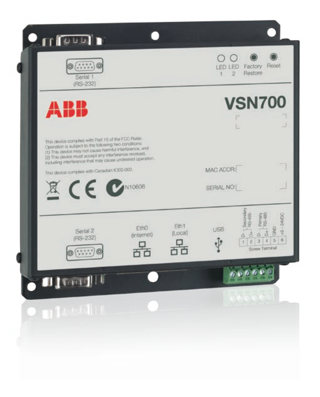
ABB monitoring and communications VSN700 Data Logger VSN700-01/ VSN700-03/VSN700-05

The high-performance VSN700 Data Logger provides simple and quick commissioning with device discovery and automatic IP addressing as well as remote management features.