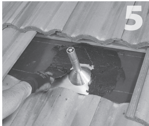
5 Apply 1/8" thick layer of roofing cement around the top and sides of the sub-flashing with at least 1" extending past the sides of the flashing onto the felt. Layer should be about the thickness of a nickel.