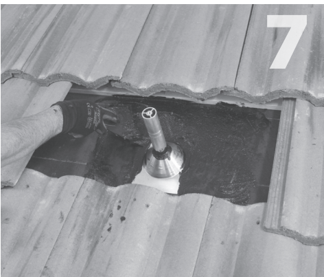
7 After first layer of cement is dry apply second layer over reinforcing fabric to finish waterproofing of sub-flashing.