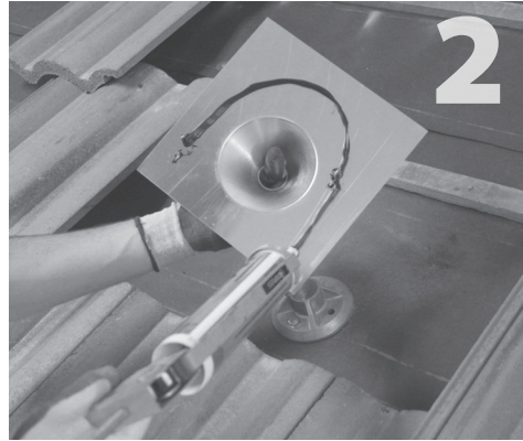
2 Apply a bead of sealant in the shape of an upside down U on the back side of the sub-flashing.