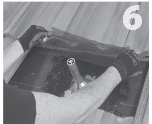
6 While cement is still wet apply 3 pieces of reinforcing fabric strips where felt paper and flashing meet – a 14" strip along the top, and a 10" strip along each side.