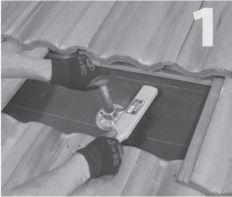
1 Clean away dust and debris around QBBase.

WARNING: Quick Mount PV products are NOT designed and should NOT be used for anchoring fall protection equipment.