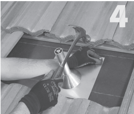
4 Fasten the sub-flashing into place with two roofing nails, one in each top corner.