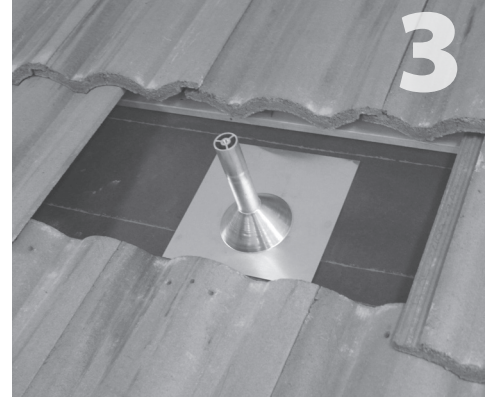
3 Install the sub-flashing over the post, making sure the edge closest to the cone is on the downhill side.