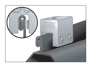
*S-5! clamps are designed to engage the seam.