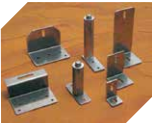
Easy Feet™, Power Post™ and "L" Feet Supports