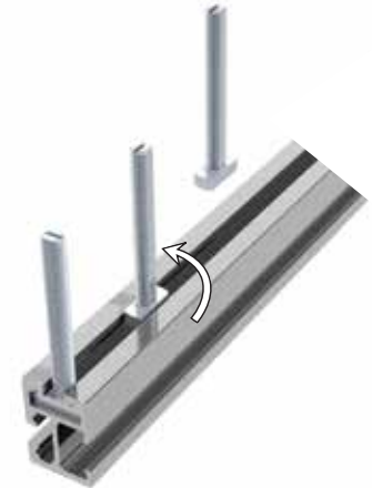
Lock-In-Place RAD™ Fastener – Patent Pending