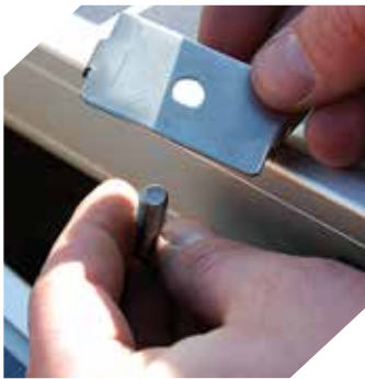
Lock-In-Place RAD Bolt