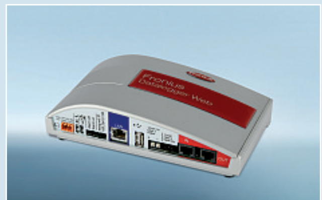
Fronius Datalogger Web

Using Fronius Solar.web via the Internet. If desired, Fronius Datalogger Web can send data automatically to the Fronius Solar.web Internet platform. This enables you to access real time system data as well as archived data anytime, anywhere via the Internet.