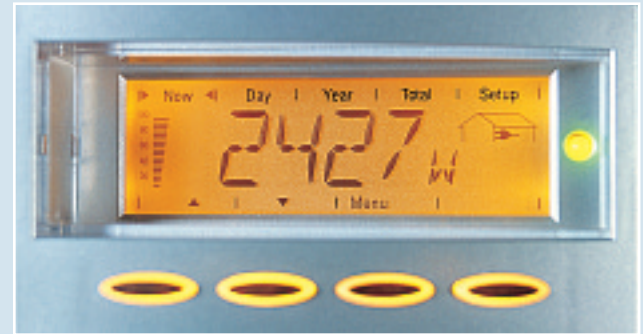
The Fronius Personal Display shows real time data from up to 15 inverters.

The Fronius DATCOM system is very easy to install and operate. The components are compatible with all Fronius inverters. For perfect data communication.