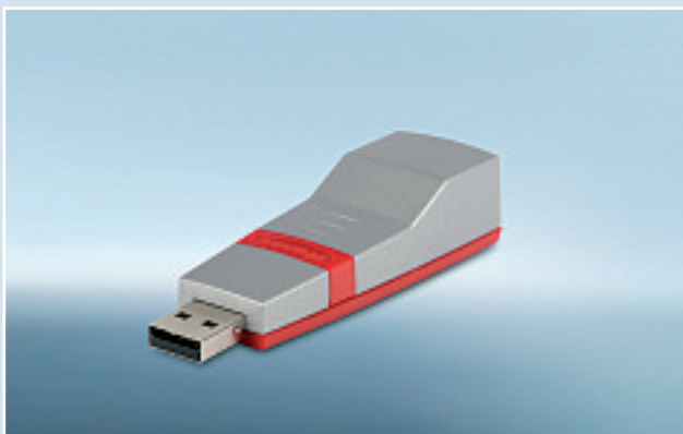
Fronius Converter USB

a RS232 hardware interface or into a USB hardware interface. There is no need for conversion of the software protocol.